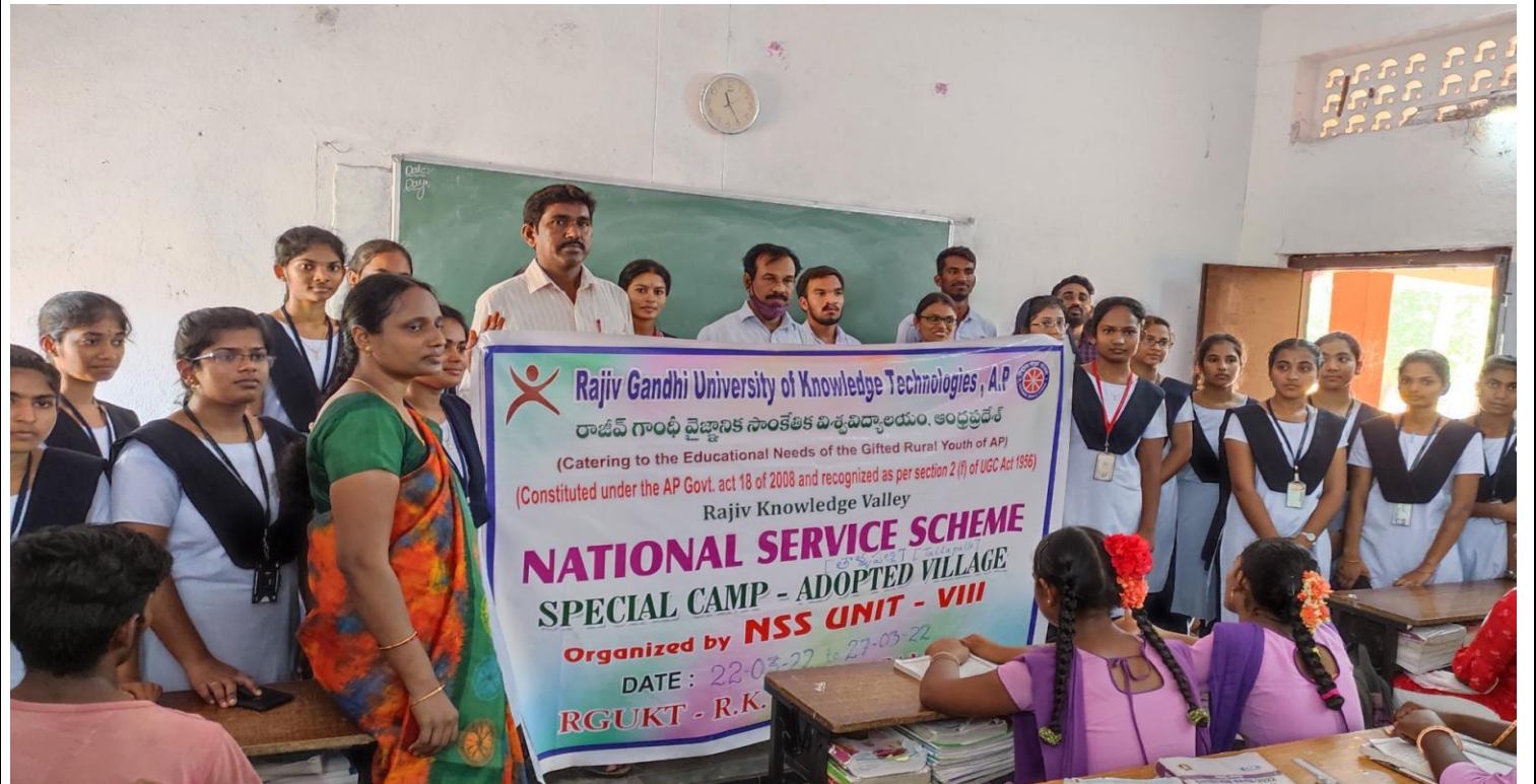
NSS volunteers counselling to the elementary students and 10 th class students