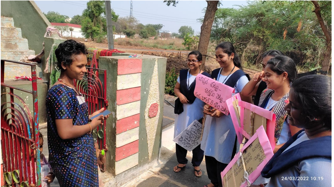
NSS Students explaining the importance of clean surroundings and how to avoid mosquito and other insects by using household things