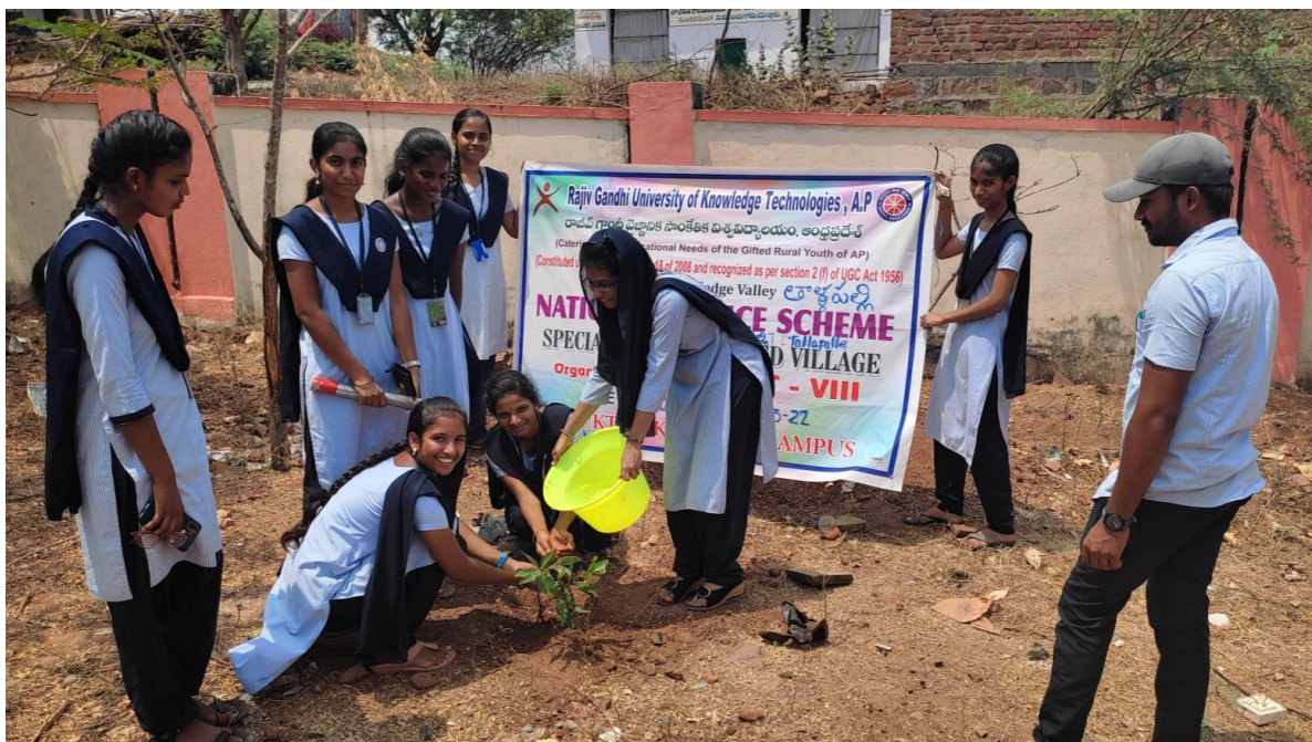
NSS Volunteers planting a Neem Tree at Thallapalle High school

Tree Plantation is one of the best activities for making the planet greener, livelier, and healthier. Planted trees help our biodiversity, ensure the supply of oxygen for the next generations, and provide us with various resources. Without trees, the existence of human life, as well as other species on earth, is impossible. So, we should plant more and more trees.Planting trees is the ideal approach to support nature. It additionally helps other living species, including people, in many ways. Trees give us oxygen, food, shelter, and many more. They are natural air filters and noise safeguards. Areas having a thick estate of trees, are seen to be less loud and generally having cleaner air than the zones without trees.