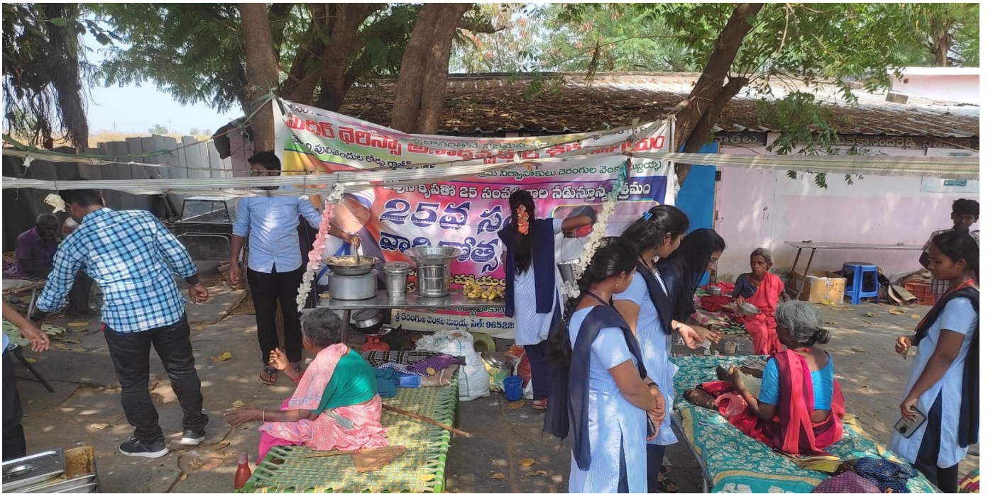
NSS Volunteers distributing Fruits and Food to the Old age people