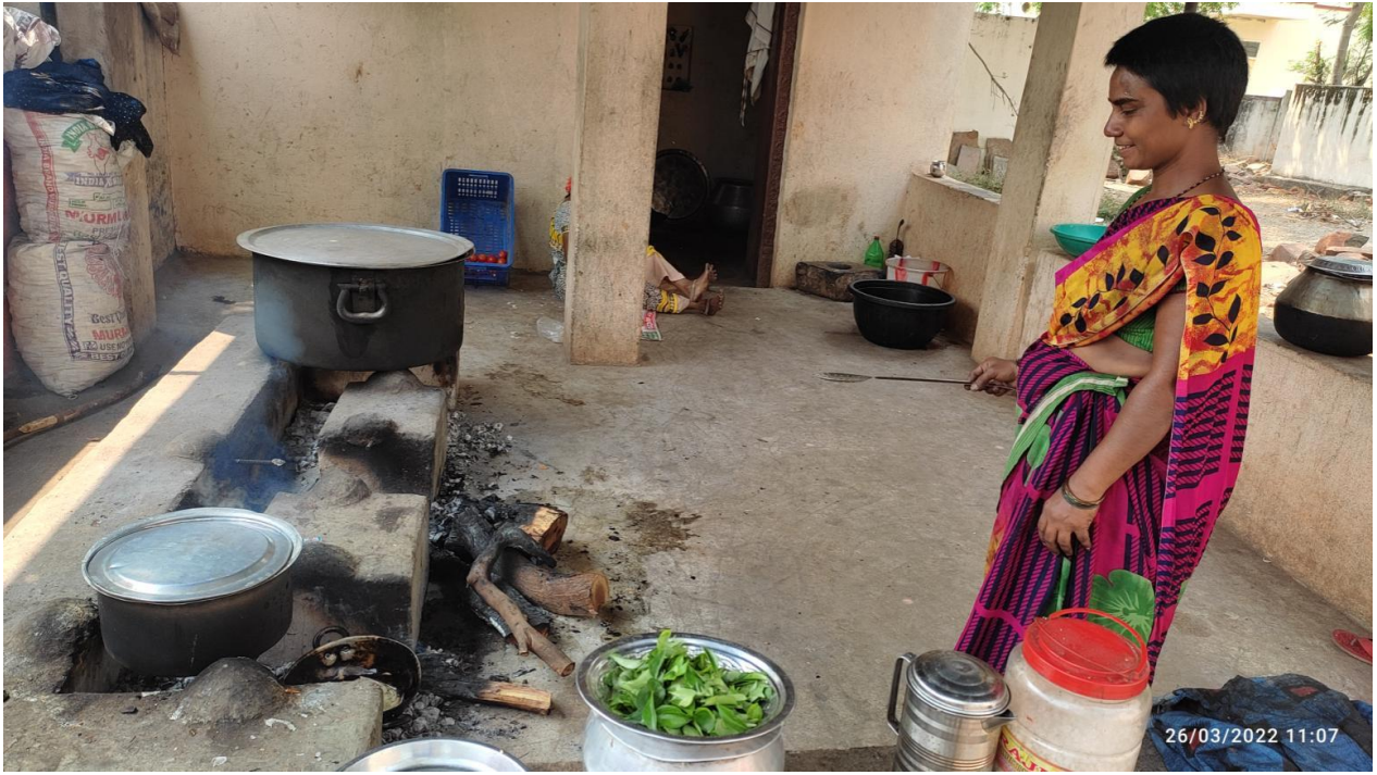
NSS volunteers explaining to the cook in the Thallapalle high school that how the classlessness helps to improve the health of students