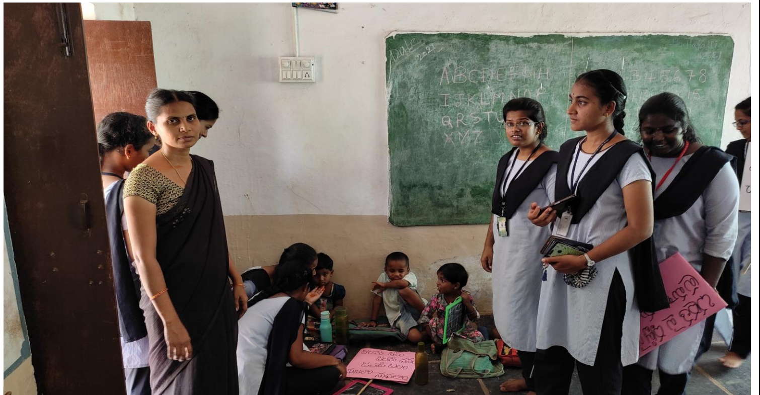
NSS volunteers visiting Elementary and high school students.