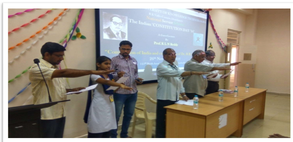
Figure: Student and Faculty take oath on the occasion of Constitution day

NSS volunteers of IIIT RK Valley assembled to celebrate Constitution Day. They had pledge of Constitution of India Preamble along with dignitaries of university. After that Prof. K.L.N. Reddy delivered a Lecture on “Constitution of India and contribution of Dr. B.R. Ambedkar” from 9:30am to 11:00am. Later, volunteers conducted a rally with slogans in the campus and inspired students.