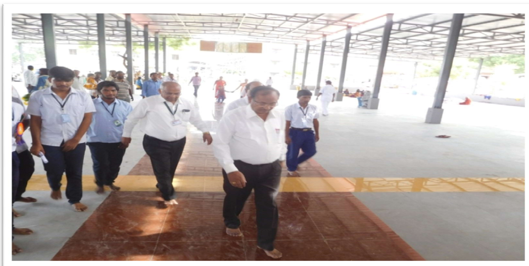
Figure: The Directors of IIIT R K valley and IIIT Ongole at Gandhi temple Constitution day