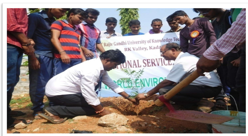
Figure: The Director and the NSS Officers involved in plantation drive.

World Environment Day is celebrated every year on 5th June to raise global awareness to take positive environmental action to protect nature and the planet earth. The Director and addressed to students about the protection of environment and the effects of negligence. On the occasion of World Environment Day, a Plantation drive was launched in RK valley Campus. Around 100 saplings were planted with all varieties which include: Jamun, Almond, Neem and guava were planted in and around the campus premises. Volunteers NSS units participated enthusiastically and came together to highlight the importance and awareness towards environment.