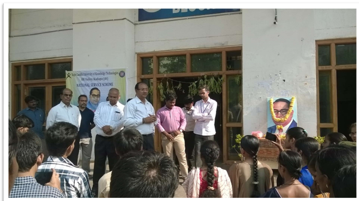
Figure: The Director IIIT R K Valley addressing the gathering

Every year we celebrate the birth anniversary of Dr. B.R.Ambedkar, the father of Indian constitution, on 14 th April. On this occasion several programmes were organized by NSS. Some of the activities are Essay Competition, Elocution Competition on life and works of Dr. Ambedkar, and Quiz Competition. The students participated in all these competitions under the guidance of Director of the University. One of the appreciated events was the elocution competition where total 15 students from B. Tech as well as PUC participated. Authorities addressed motive speeches to students about the life of Ambedkar and the formation of Indian Constitution.