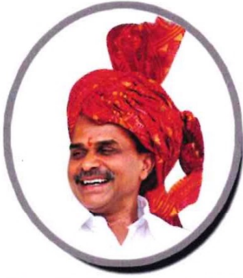
Dr. Y.S. RAJASEKHARA REDDY Former Chief Minister of Andhra Pradesh

RGUKT instituted Lecture Series in memory of DR.Y.S. RAJASEKHARA REDDY, Former Chief Minister of Andhra Pradesh who initiated, founded and nurtured RAJIV GANDHI UNIVERSITY OF KNOWLEDGE TECHNOLOGIES to provide technical education to the meritorious rural youth of Andhra Pradesh.